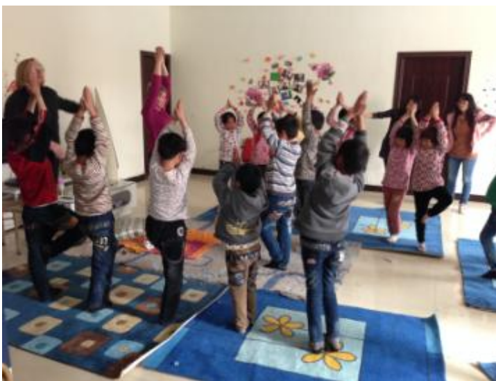
Children strike giraffe poses

It's important to understand that children's yoga is completely different from adult yoga. In children's yoga, the focus is entirely on body awareness. It's not about correcting poses, if there are any poses. And it should be fun! Take the children for a trip into the forest and meet different animals and depict poses based on them, such as those of monkeys, snakes and giraffes. Let them play and laugh.