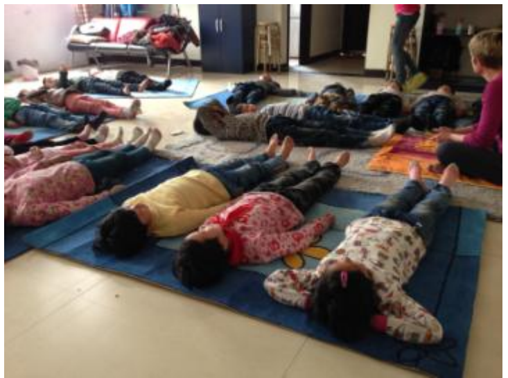
Yoga class ends with relaxation and amazing children

But again, it was a fun class with much laughter and children.