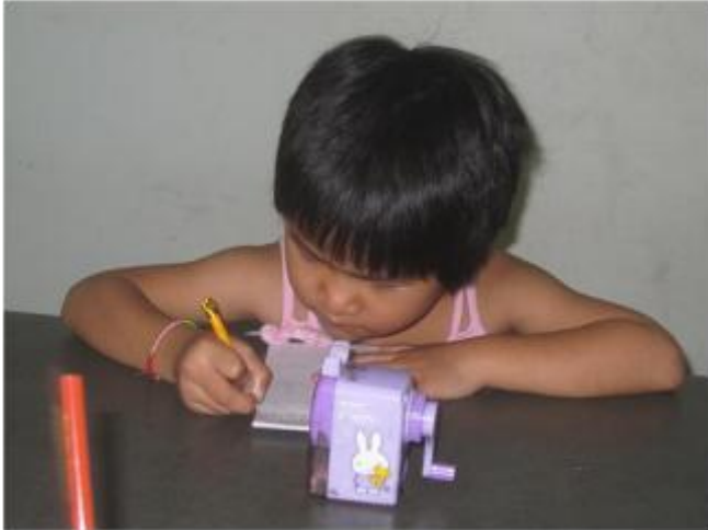
Writing a letter to Dad before the visit

Visiting Mother (This picture we received from the prison. Our social workers and children are not allowed to take cameras or cell phones during their visits.)